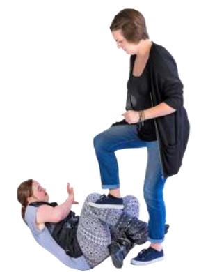
The right to not be tortured

No-one can be deprived of life intentionally