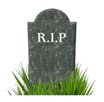
The right to life

The Coronavirus Act 2020 does not affect your human rights, for example: